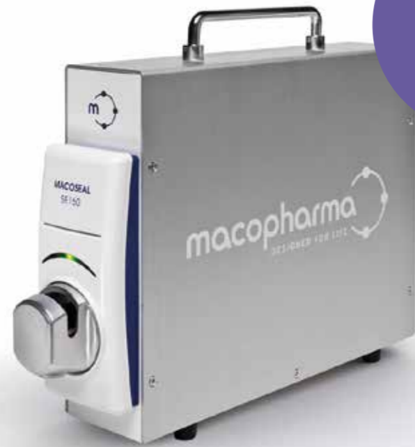
MACOSEAL SE 160