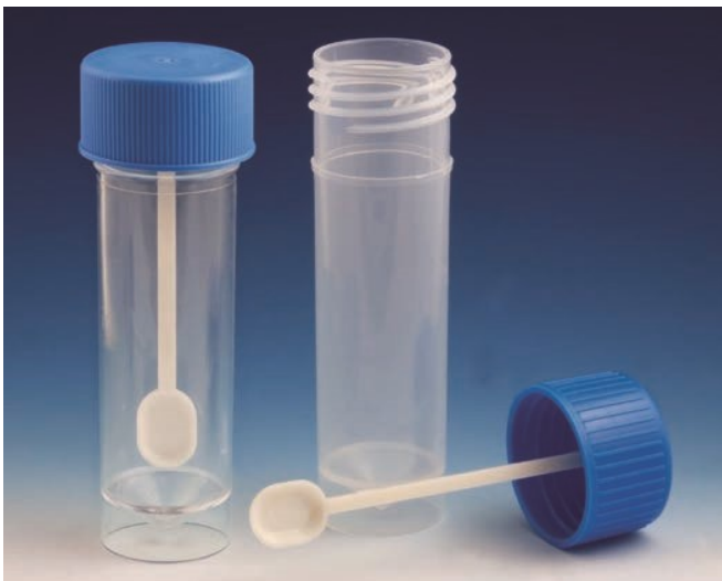
109117 — polystyrene (PS), 109120 — polypropylene (PP)