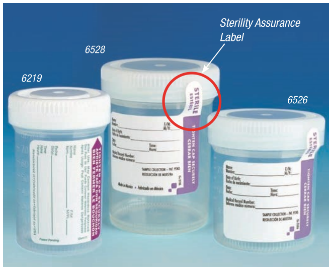
Tite-Rite™ leak resistant containers with patient I.D. and sterility assurance labels