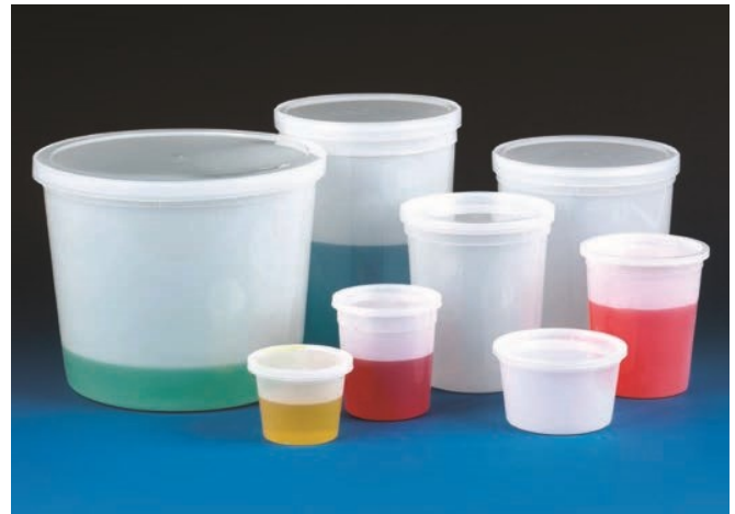
Translucent containers — 271004 – 271172