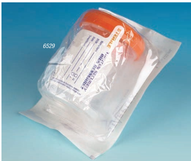
120mL container with patient I.D. and sterility assurance label, individually wrapped