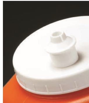
Snap valve pour spout for dripless pouring