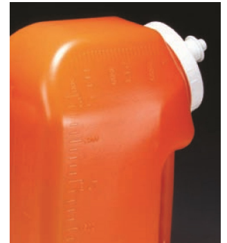
Dual oriented graduations for either vertical or horizontal use