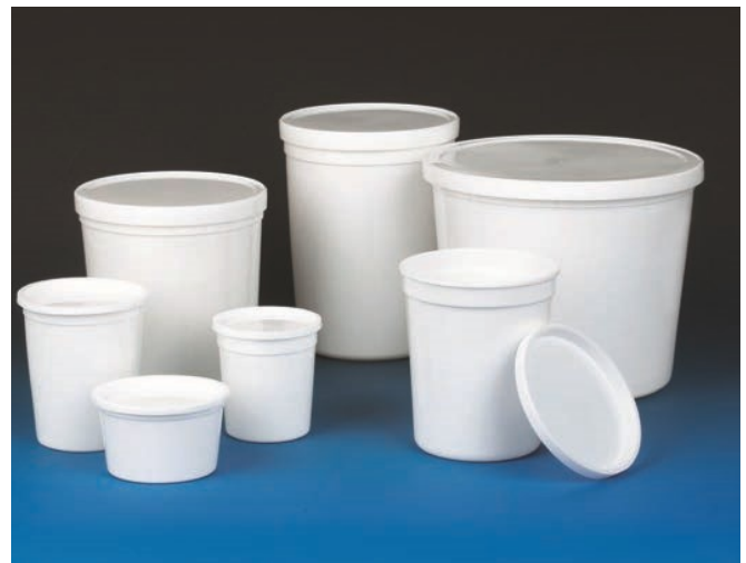
Opaque containers — 271008W – 271172W