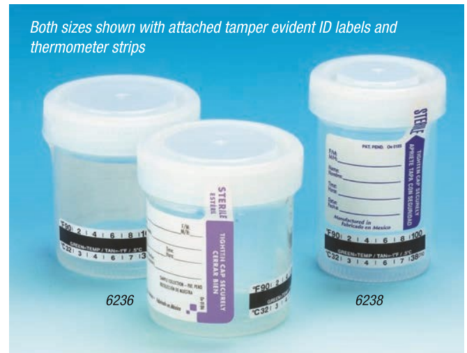
6236 & 6238