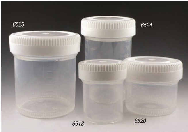
Tite-Rite™ leak resistant containers