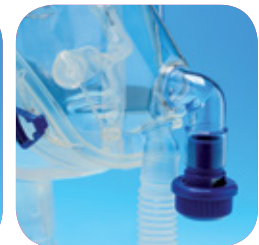
Configuration for single limb ventilator or CPAP Generator