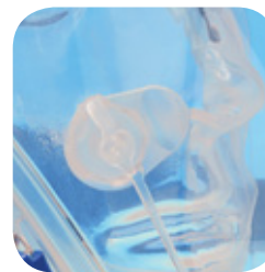
Dedicated air tight NG tube port