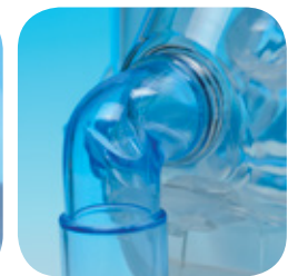
“Non-Vented” elbow for single limb ventilator