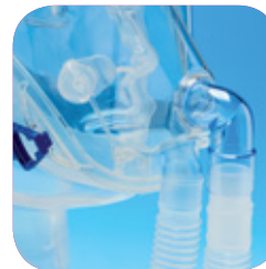
Configuration for dual limb ventilator