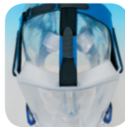
The fifth attachment point allows a better seal on patients' forehead