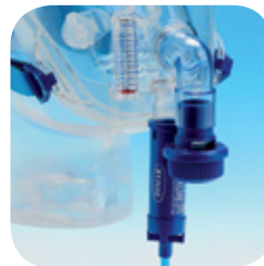
Configuration for CPAP with “Easy Vent” Venturi Generator