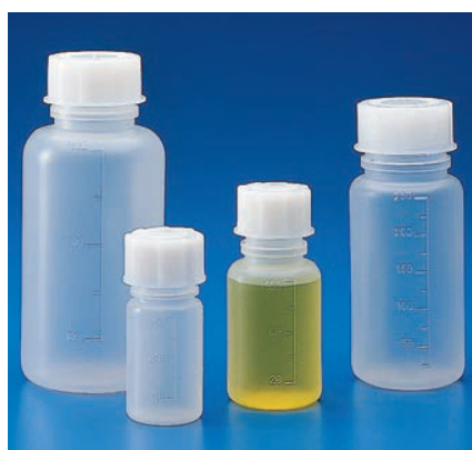
Wide mouth, round rigid bottles