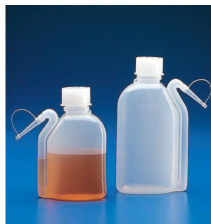
Wash bottles with integrated spout, LDPE