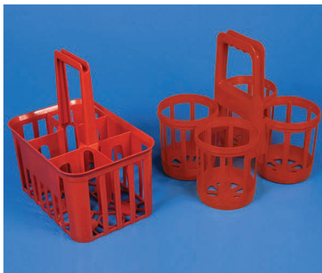
High Density Polyethylene (HDPE) bottle carriers