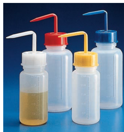
Wide mouth wash bottles, PE