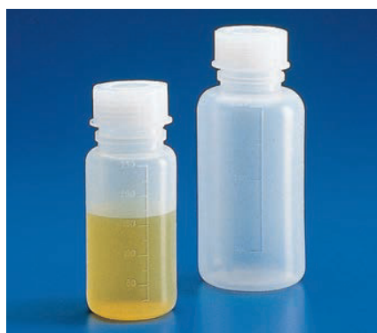
Wide mouth, round flexible bottles