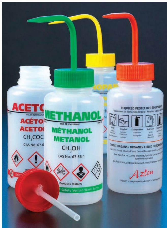
Safety-vented, pre-printed wash bottles